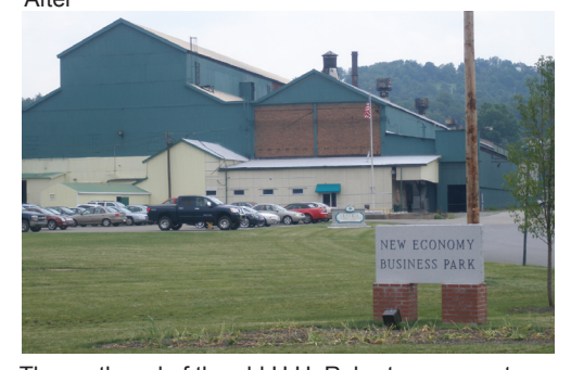
The north end of the old H.H. Robertson property across from the old Foodland. 'Before' picture courtesy of Silk House Cafe.

the Main Street Program to renovate the facade of buildings. It also started in 2003.